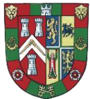
Province of Northamptonshire & Huntingdonshire