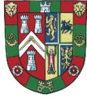
Province of Northamptonshire & Huntingdonshire